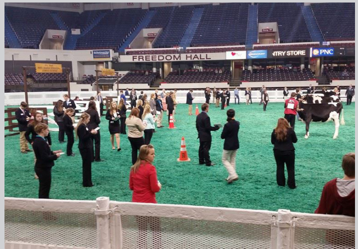
Contestants evaluate a class during the dairy cattle judging class at the 2014 North American International Livestock Exhibition in Louisville, Ky., in November.